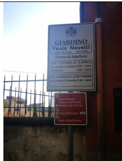
Ingresso Giardino Paolo Novelli

5ALC 3BLC 4BLC 5BLC 5HLES 3CLSU 4GLES 3HLES 5CLSU 5DLSU 1ALC 2ALC 1BLC 2BLC 1HLES 1DLSU 3GLES